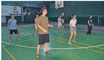
5 Go go Dance Activity