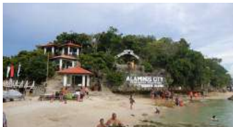
9 Hundred Island Tour