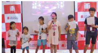
10 Singing Activity (Young Learners)