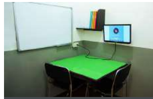
1 ON 1 CLASSROOM