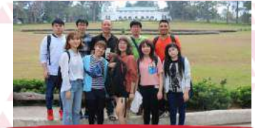
4 Baguio Trip