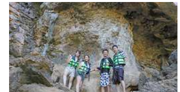
12 Minalungao Tour