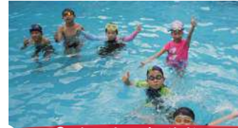
3 Swimming Activity (Young Learners)