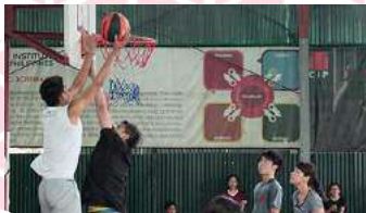
13 Sports Activity