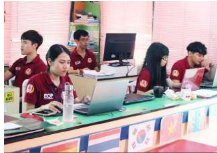
STUDENT SERVICE CENTER