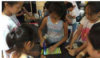
14 Art Activity (Young Learners)