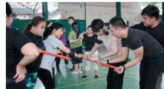
11 Amazing Race (Young Learners)