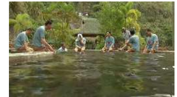
8 Puning Hot Spring