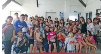
2 Orphanage Volunteer