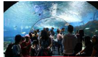
15 Manila Tour