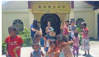
6 AETA Volunteer