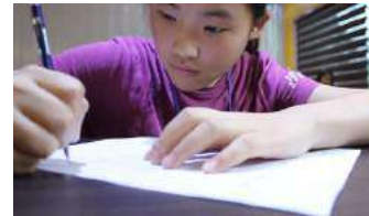
7 Spelling Bee Activity (Young Learners)