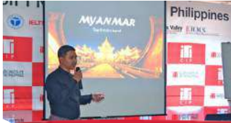
1 EOP Challenge Program