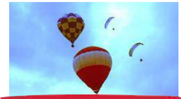
16 Hot Air Balloon